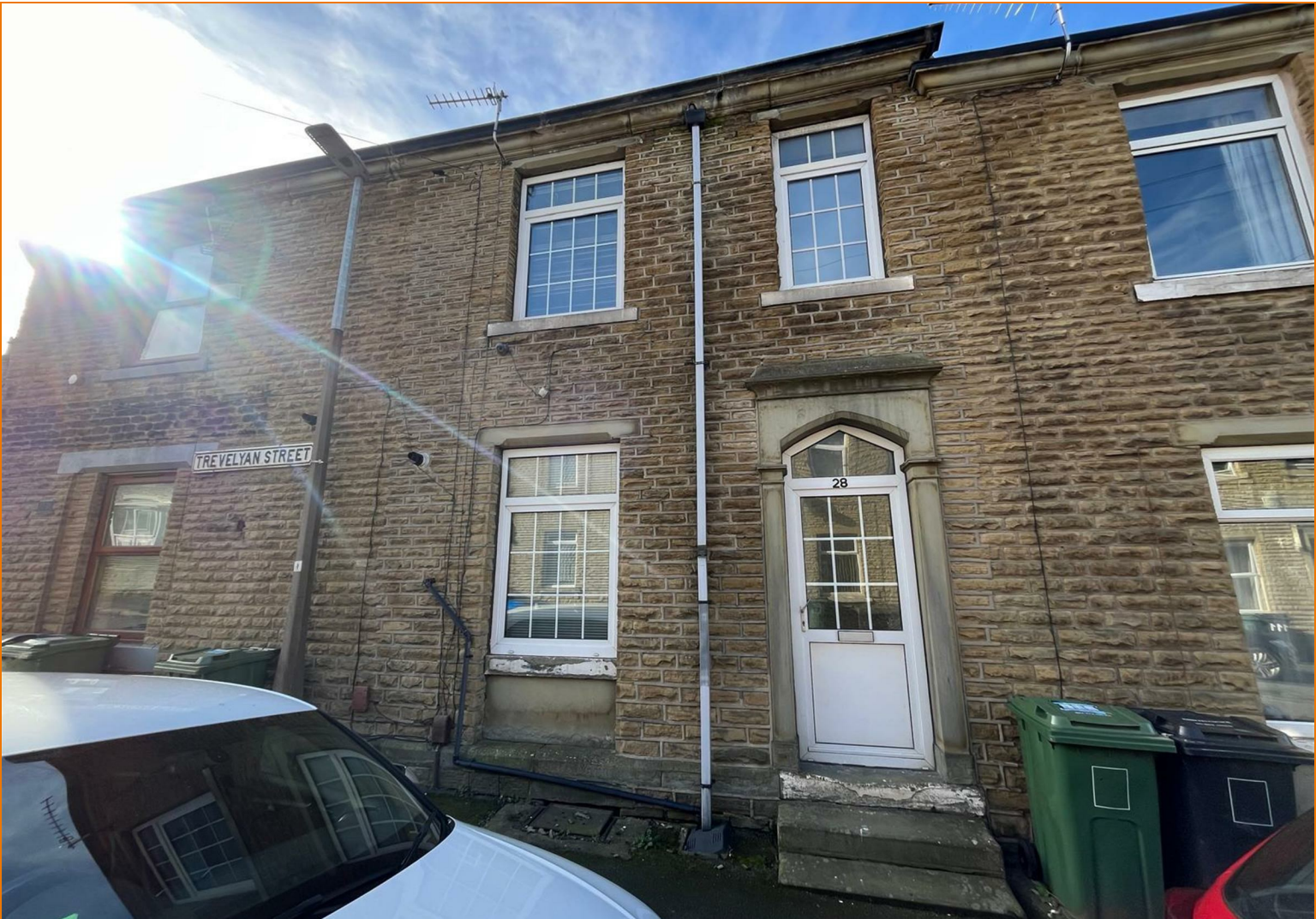
Trevelyan Street , Huddersfield, HD5 8AN